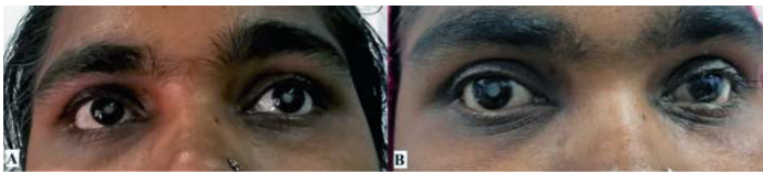
[Table/Fig-2]: (a) Patient having bilateral early-onset nuclear sclerosis-type mature cataract at presentation; (b) Patient after small-incision cataract surgery in her left eye with good restoration of vision.